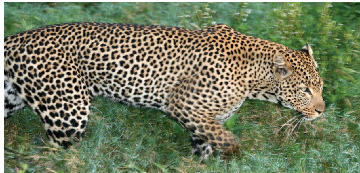
Left: Leopard running, Kenya.

The federal government has, however, pursued a tougher stance on wildlife trafficking. The Obama administration gave crucial backing to anti-poaching efforts, including the president signing an executive order establishing an interagency task force to coordinate US response across all sectors of wildlife counter-trafficking. 180,181 The order also provided $10 million in anti-poaching training and technical assistance to countries in sub-Saharan Africa. The Obama administration also issued a comprehensive National Strategy for Combatting Wildlife Trafficking in February 2014. 182 One of President Trump’s first executive orders was to allow swift action against illicit transnational organizations and transboundary trafficking. Illegal smuggling in wildlife was included among the threats listed, along with drugs, arms, and human trafficking. In addition, President Trump’s 2018 National Security Strategy calls on military and security partnerships in Africa to counter the illegal trade in natural resources, which encompasses wildlife trafficking. 183