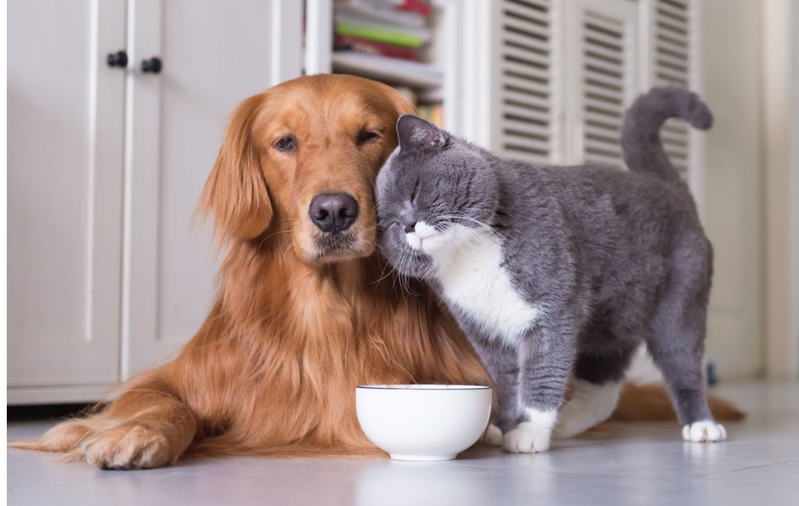
Above: Dog and cat.