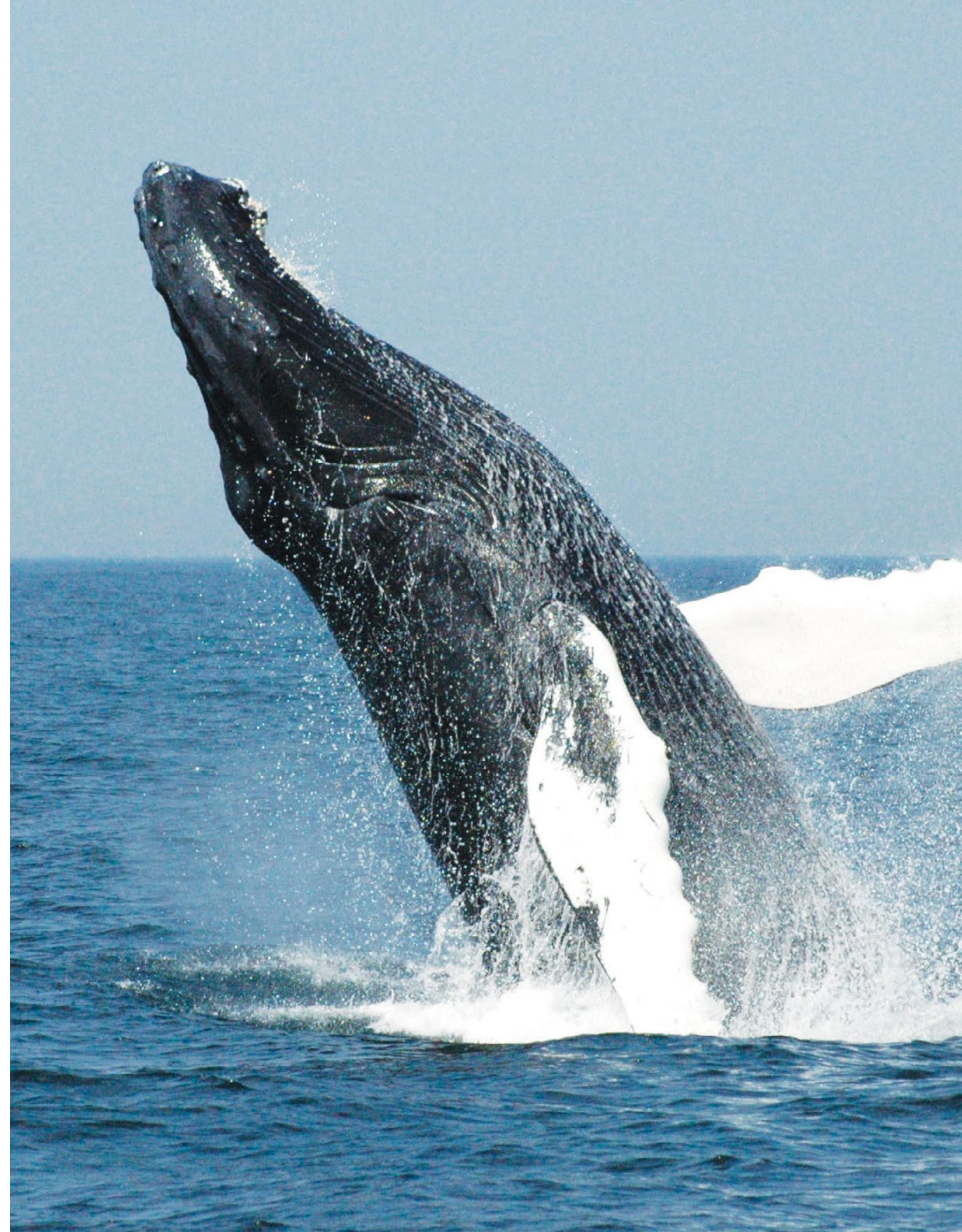
Next Page: A humpback whale breaching.