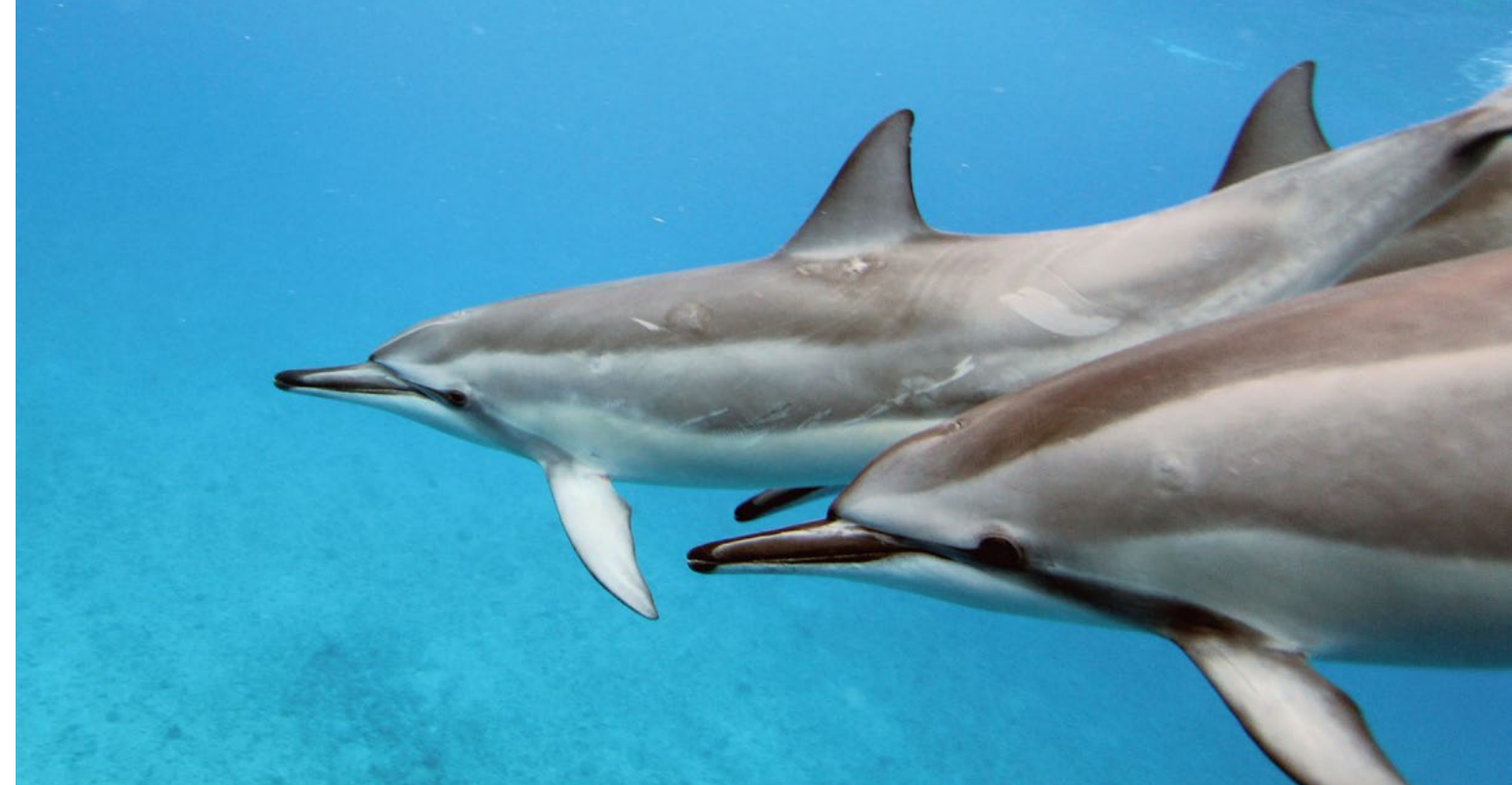
Above: A pod of spinner dolphins off the west coast of Oahu, Hawaii.

Having federal inspectors placed throughout the country should ensure animal welfare standards are followed, but audits have found significant issues with enforcement. A 2013 audit by the USDA’s Office of the Inspector General of pig slaughter plants found that “FSIS [Food Safety and Inspection Service] inspectors did not take appropriate enforcement actions at eight of the 30 swine slaughter plants” visited for violations of the Humane Slaughter Act. The Inspector General also reviewed 158 humane handling noncompliance records (violations) issued to the 30 plants and found ten instances of egregious violations where inspectors did not issue suspensions. As a result, the plants did not improve their slaughter practices, and FSIS could not ensure the humane handling of swine. 206 In addition to results from the audit, the USDA also removed public access to thousands of documents related to animal welfare violations – which means information about inspections done by APHIS found online is incomplete. 207