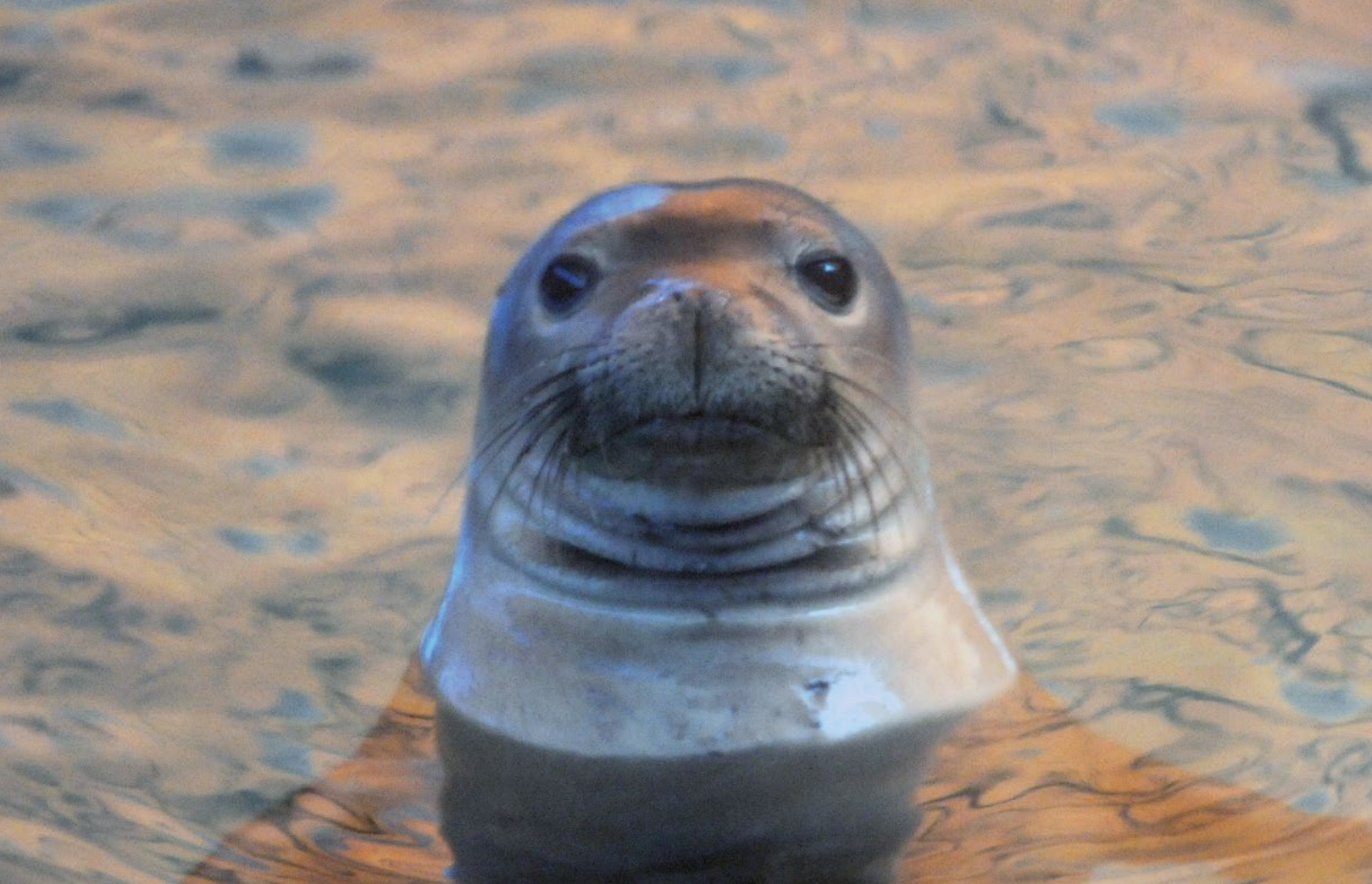
Above: A rescued monk seal in Kona, Hawaii.