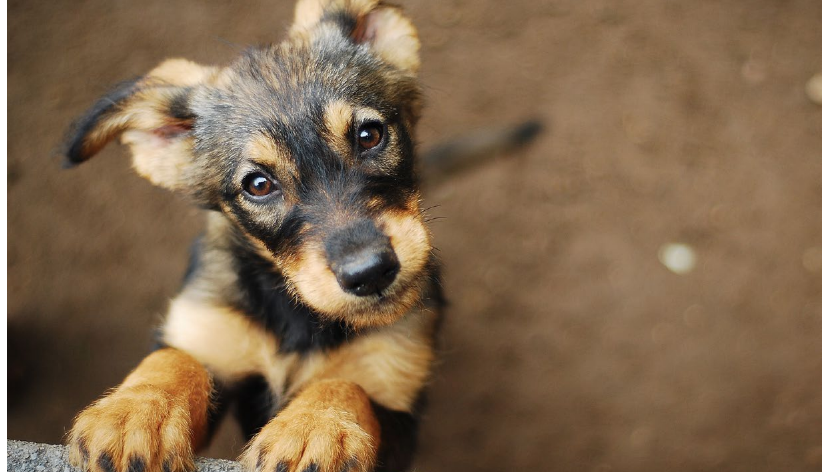
Above: Puppy.