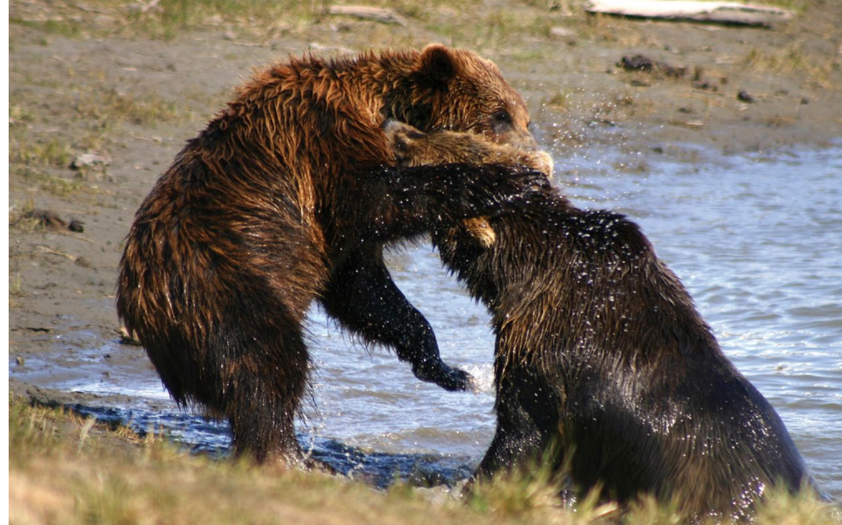
Above: Grizzly bears near the Alaska Wildlife Conservation Centre in Alaska, USA.