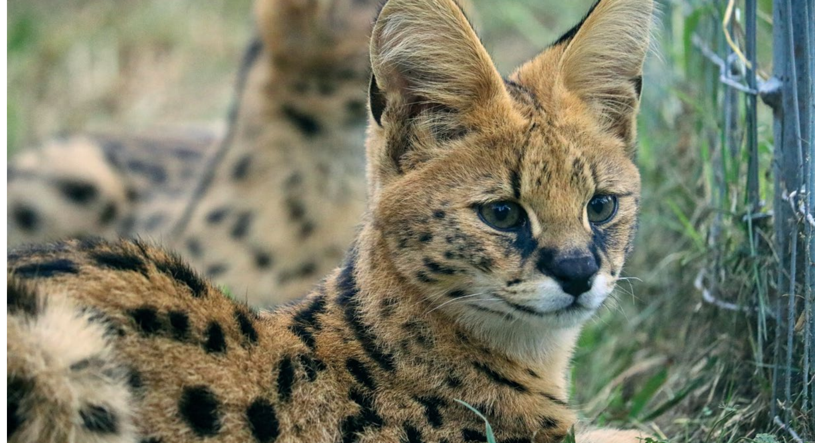
Above: Sammy the Serval in his new outdoor enclosure at Turpentine Creek Wildlife Refuge in Arkansas (October 2018).