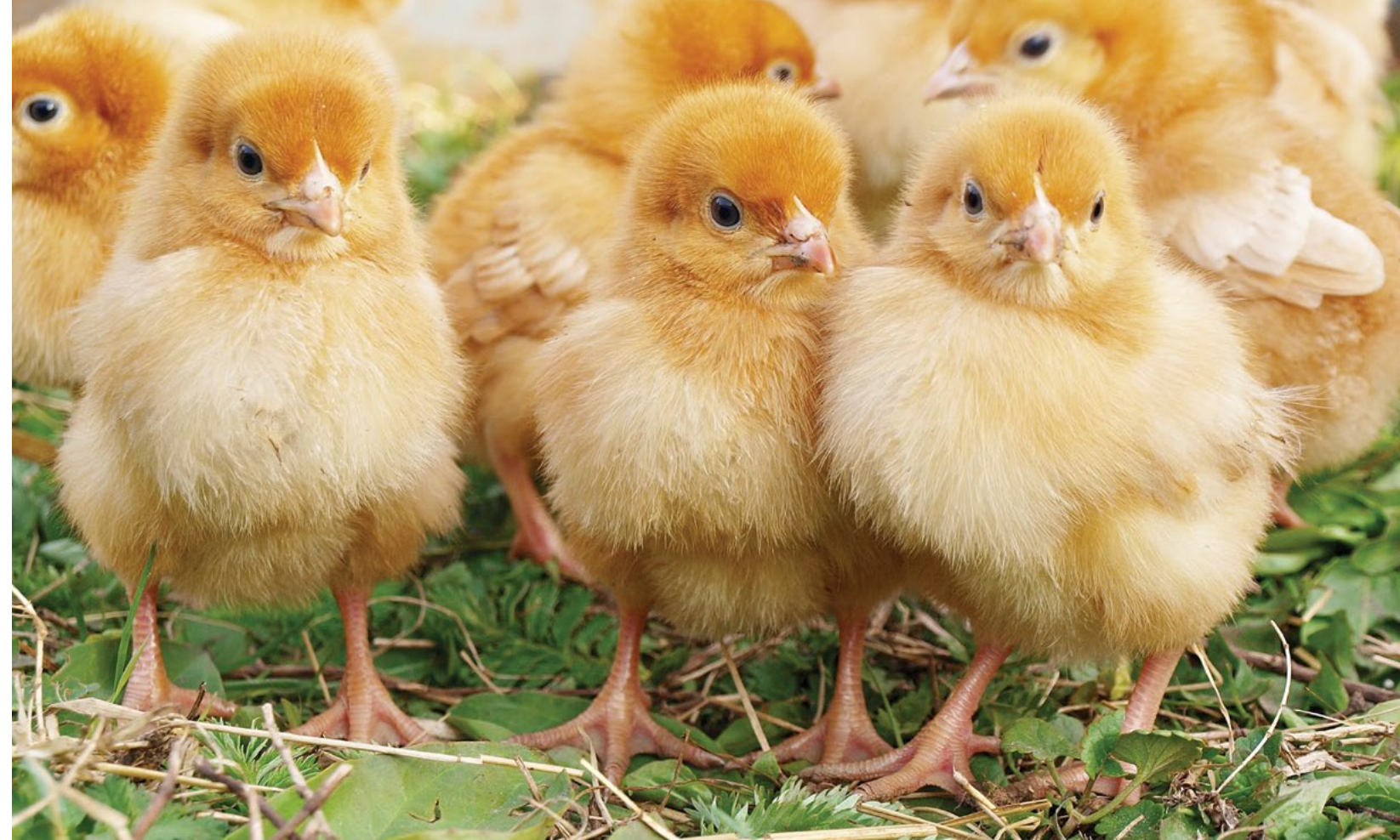
Above: Baby chicks.

Animal protection laws in the US have much room for improvement. The Animal Welfare Act's (AWA) provisions do not apply to birds, to rats or mice used in research, to horses – except if they are being used in research – or to farmed animals. The US Department of Agriculture (USDA) oversees and regulates animal protection laws on a limited number of issues; its subsidiary,