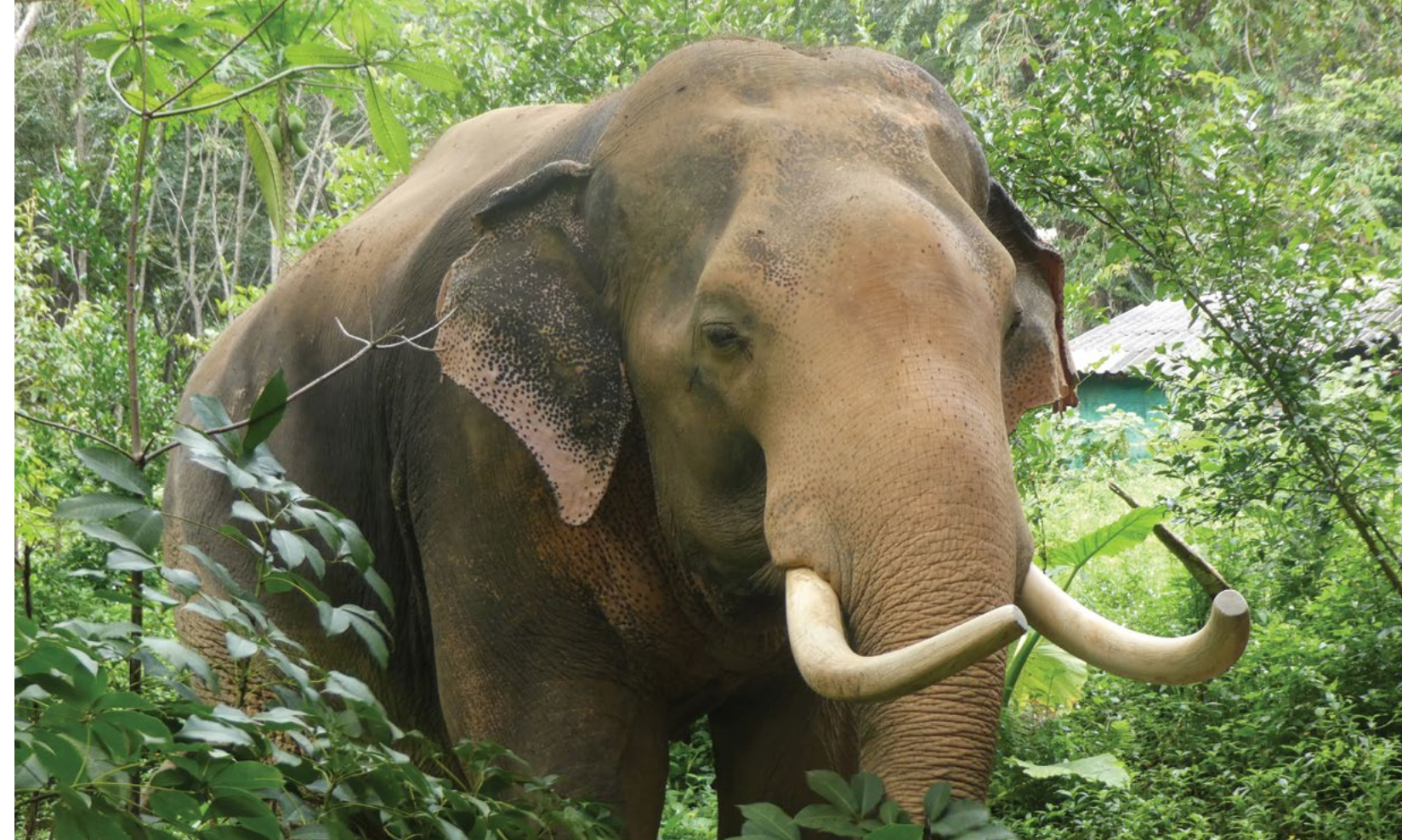
Above: Chok is a calm and gentle 29-year-old male elephant who has lived at Eco-tourism Koh Lanta for more than seven years. He was born into captivity and originally used in the harsh logging industry.