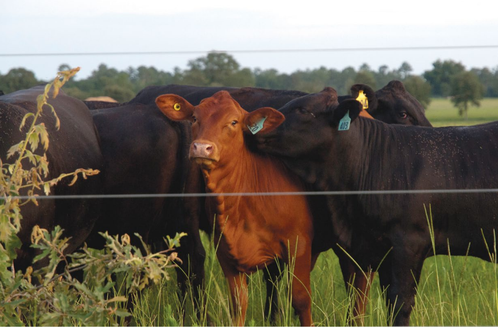
Above: Case study: White Oak Pastures in Georgia, rears 650 grass-fed cows (pictured), as well as sheep and free-range poultry. Animals live on the pastures their entire lives and can perform natural behaviors.