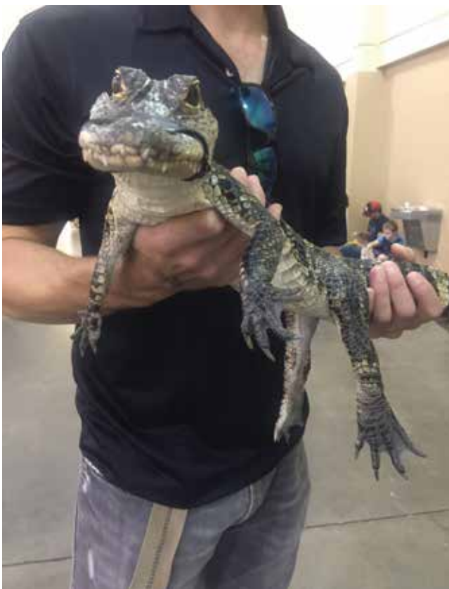
Below: A reptile at a pet expo in Florida, USA.

Currently, the annual value of the wildlife trade stands at USD30-42.8 billion. 13 Shockingly, up to USD20 billion is estimated to be illegal – a substantial proportion of this economic value is in endangered and protected species being traded as pets. But whether captive bred or poached from their wild environment, the trade has a devastating impact on the animals forced to endure a life of captivity – mentally and physically. Legal or illegal, it's all cruel.