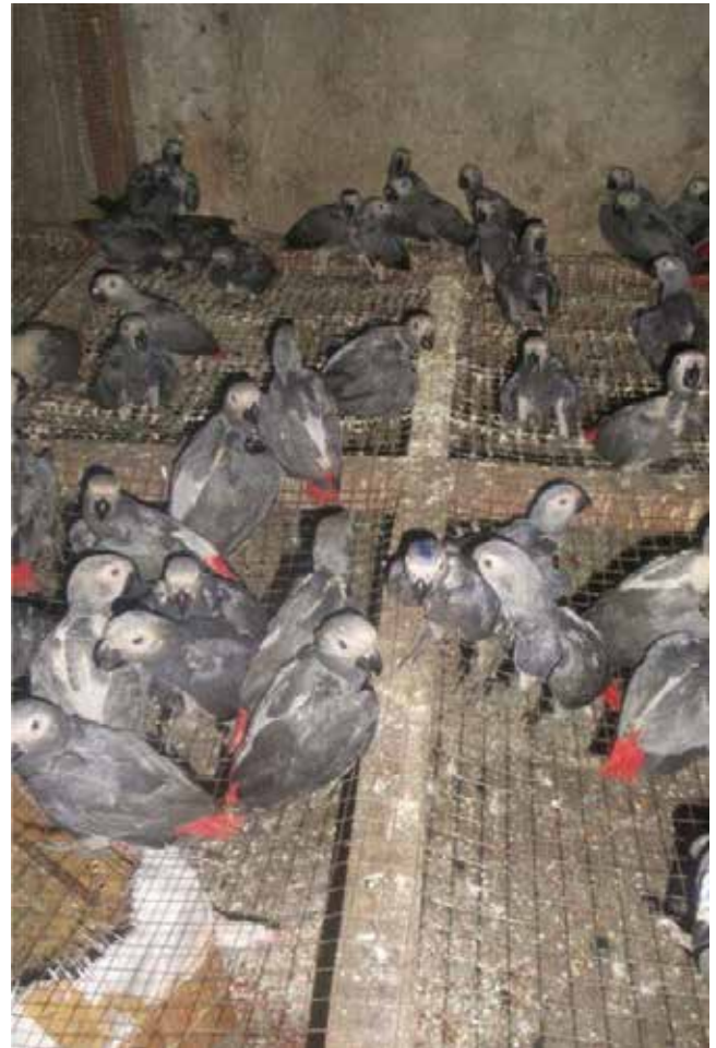
Above: African grey parrots during transportation.

World Animal Protection is calling on Turkish Airlines to stop transporting all birds, until it’s sure African grey parrots and other protected species aren’t being flown illegally on its planes.